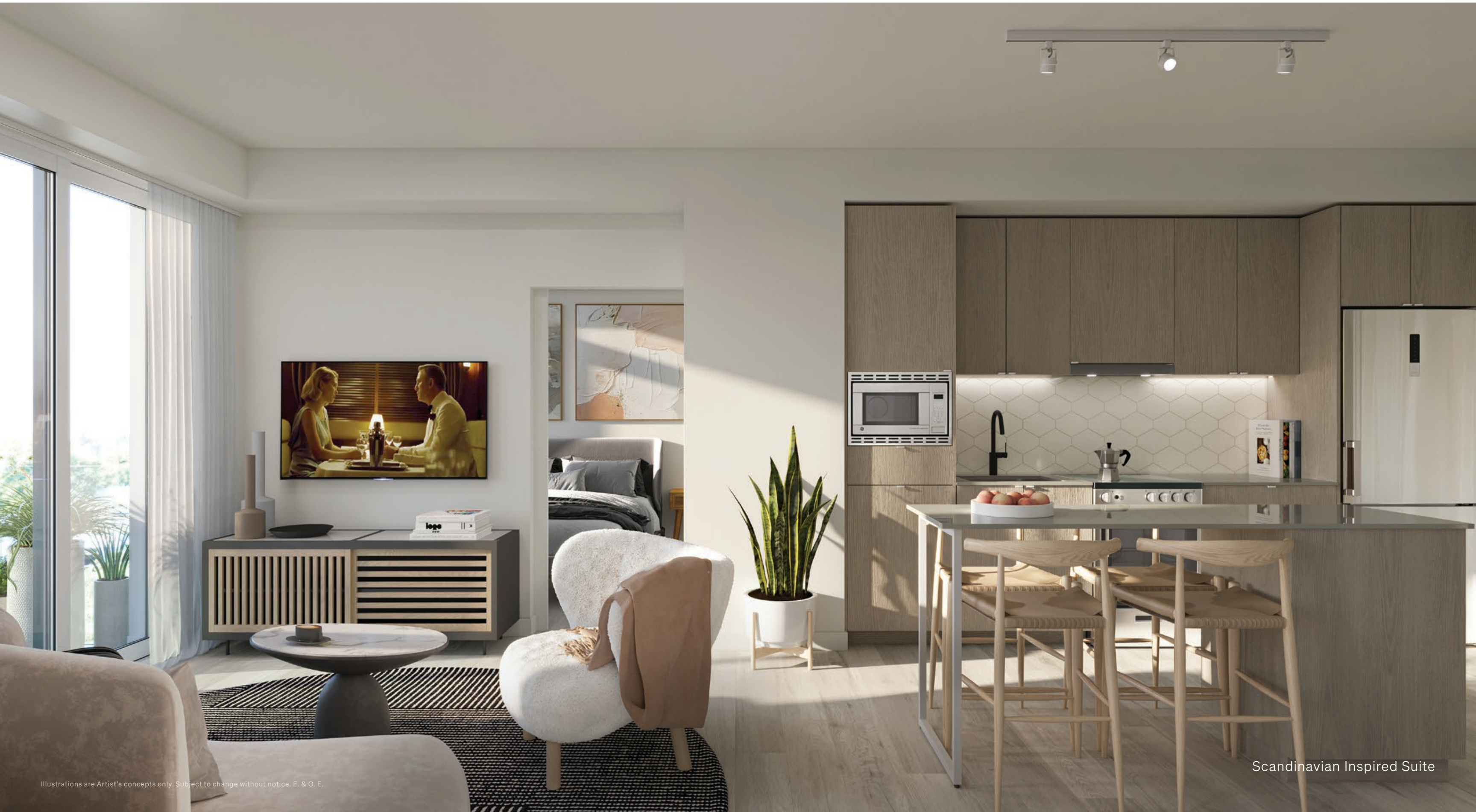
Scandinavian Inspired Suite

A relaxing retreat and the hub of your home life, the living area is as space-efficient as it is serene. With smart thermostats working for you for seamless comfort, you can always control your home's temperature from anywhere. Your modern kitchen/dining area is designed to enhance your culinary experience, whether you're entertaining guests or putting together a quick meal.