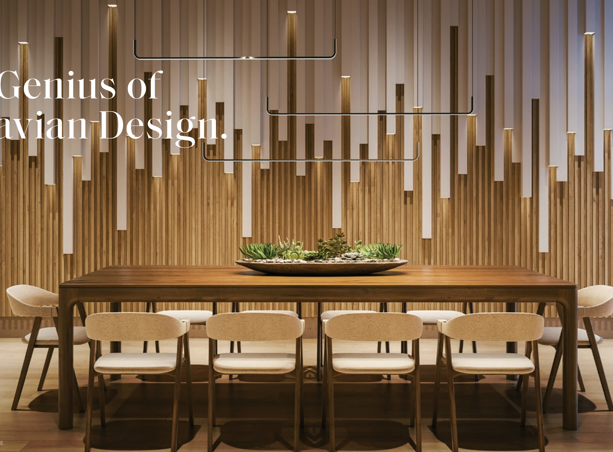
Private Dining Space